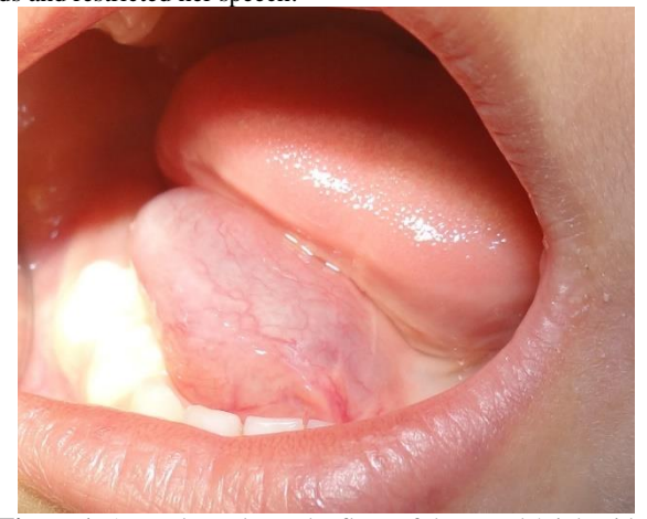
Figure 1. An oral ranula on the floor of the mouth/ right side, causing deviation of the lingual frenulum toward the left side and crossing the midline.

A provisional diagnosis of ranula has been made on the basis of history and clinical features. Non-invasive diagnostic method was taken for diagnostic purpose, such as a neck ultrasound with focusing on the floor of the mouth and submandibular area. Neck ultrasound confirmed the diagnosis of ranula with no indication of any calcific duct obstruction [Figure 2]. In the second visit, after three days, the patient's father mentioned that the swelling's colour has changed to blue and became associated with moderate pain while chewing food and speaking, the thing that forced his daughter to stop eating solid foods and restricted her speech.