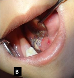
Figure 4. A. Suturing the lesion lining membrane with the floor of the mouth mucosa. B. Iodoform packing used to fill the ranula cavity. The gauze were sutured to surgical site.