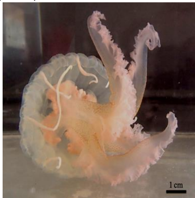
Fig. 2: General morphology of Pelagia noctiluca .