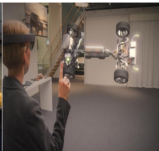
Fig 3. Classroom demonstration using Microsoft HoloLens [42]